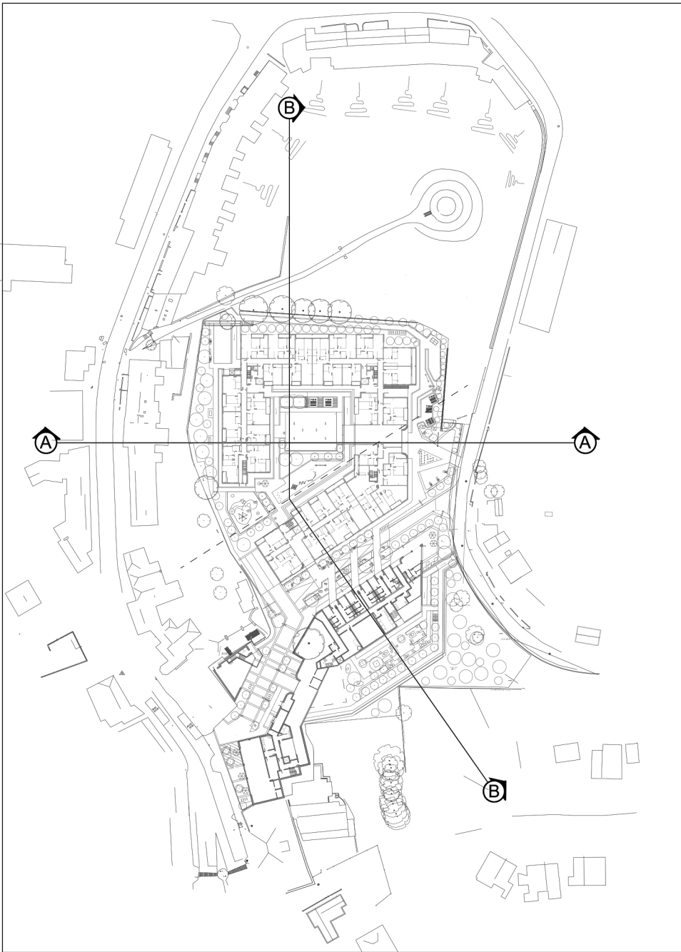
Key Plan 1 : 5000